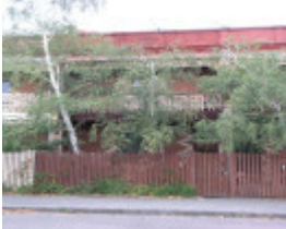
DOROTHY TERRACE SOHE 2008