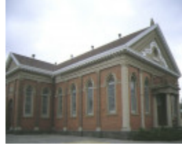
1 st mary's hall geelong side elevation apr1997