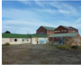
2013 Amenities building, main building and tanks from north east.jpg