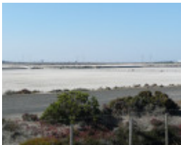
CHEETHAM SALTWORKS SOHE 2008