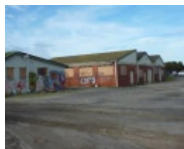
2013 Workshop building.jpg