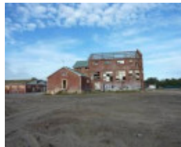
2013 Main building from north.jpg