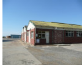
CHEETHAM SALTWORKS SOHE 2008