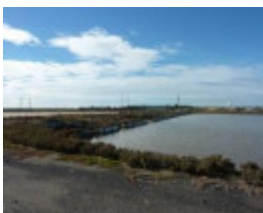
2013 Crystalliser pan.jpg