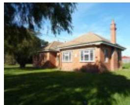
2013 Former Cunningham Memorial Hall and Library .jpg