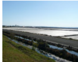
CHEETHAM SALTWORKS SOHE 2008