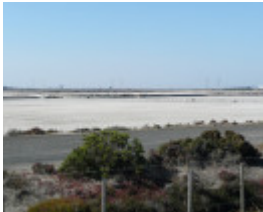
CHEETHAM SALTWORKS SOHE 2008