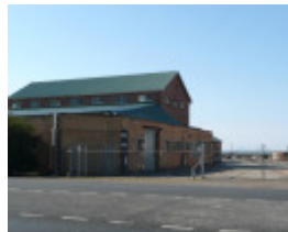
CHEETHAM SALTWORKS SOHE 2008