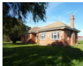
2013 Former Cunningham Memorial Hall and Library .jpg