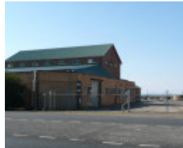
CHEETHAM SALTWORKS SOHE 2008