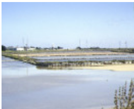
1 cheetham saltworks portarlinton road moolap crystallisers nov1995