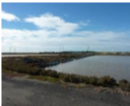
2013 Crystalliser pan.jpg