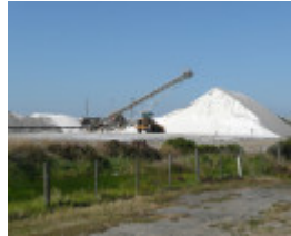
CHEETHAM SALTWORKS SOHE 2008