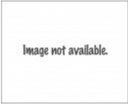
2013 Former manager's residence.jpg