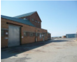
CHEETHAM SALTWORKS SOHE 2008