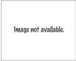
2013 Former manager's residence.jpg