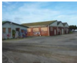
2013 Workshop building.jpg