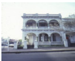
1 residence 122 nicholson street fitzroy side view