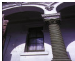
residence 122 nicholson street fitzroy balcony column detail