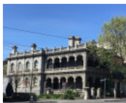
RESIDENCE October 2016