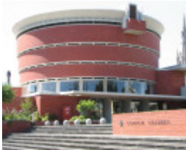
BRIGHTON MUNICIPAL OFFICES SOHE 2008