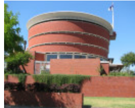
BRIGHTON MUNICIPAL OFFICES SOHE 2008