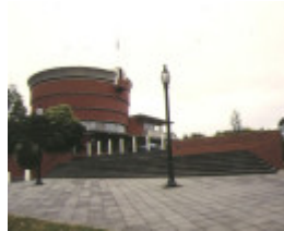
1 brighton municipal offices side view