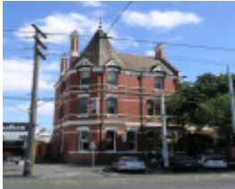
ANZ BANK SOHE 2008