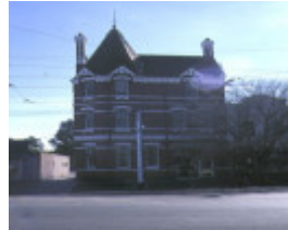
anz bank queens parade fitzroy north front view jul1986