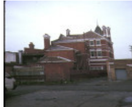
anz bank queens parade fitzroy north rear view 1989