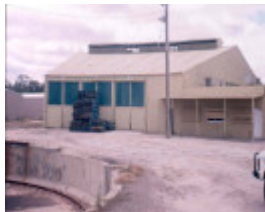
h01093 locodepot ararat march95