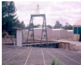
h01093 turntable ararat march95