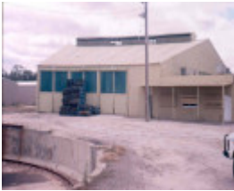
h01093 locodepot ararat march95