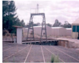
h01093 turntable ararat march95