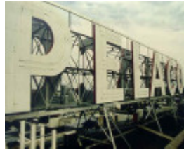
1 pelaco sign skyview 1998