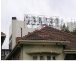
PELACO SIGN SOHE 2008