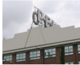
PELACO SIGN SOHE 2008