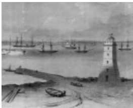
The-Williamstown-Jetty-and- Lighthouse-circa-1853- 317x400.jpg