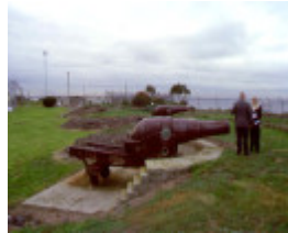
1 fort gellibrand point gellibrand williamstown gun emplacements pm2 july1999