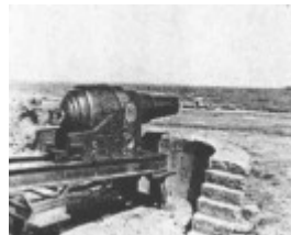
A-1869-Sir-William- Armstrong-rifled-muzzle- loading-fortress-gun