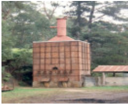
H02012 kurth kiln