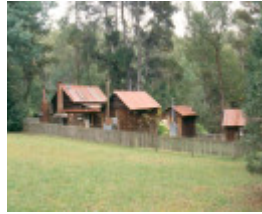
H02012 kurth kiln huts