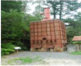
KURTH KILN SOHE 2008