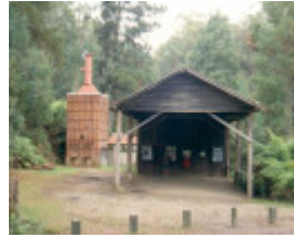
H02012 kurth kiln and storage shed