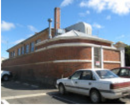
Ararat Civic Precinct Brick wall at rear of Shire Hall