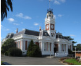
2011_Mar_2_ShireHall_Ararat (38) town hall