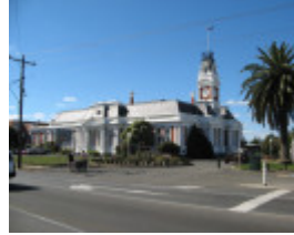
Ararat Town Hall