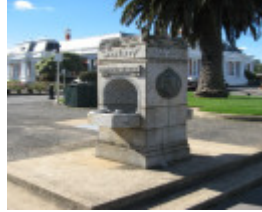
Ararat Civic Precinct King George V drinking fountain