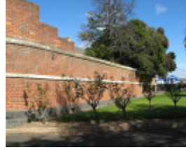
Ararat Civic Precinct brick wall at rear of Shire Hall