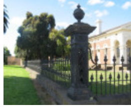
Ararat Civic Precinct iron fence around Shire Hall