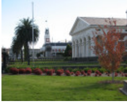
Ararat Civic Precinct