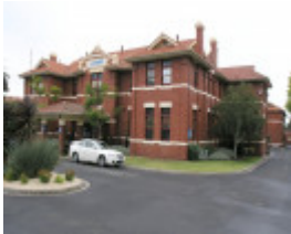
FAIRFIELD HOSPITAL (FORMER) SOHE 2008