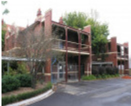
FAIRFIELD HOSPITAL (FORMER) SOHE 2008