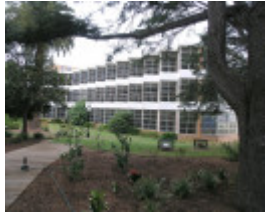
FAIRFIELD HOSPITAL (FORMER) SOHE 2008