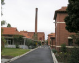
FAIRFIELD HOSPITAL (FORMER) SOHE 2008