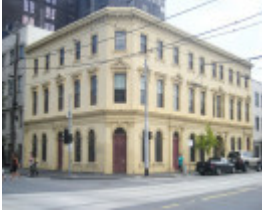
FORMER EASTERN HILL HOTEL SOHE 2008