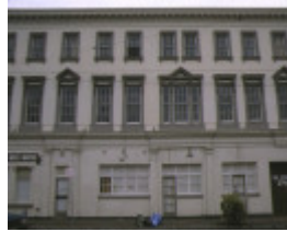
former eastern hill hotel victoria parade fitzroy front view