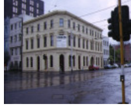
1 former eastern hill hotel victoria parade fitzroy corner view