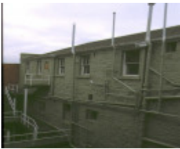
former eastern hill hotel victoria parade fitzroy rear view