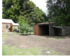
FORMER BLACKSMITH'S COTTAGE AND SHOP SOHE 2008