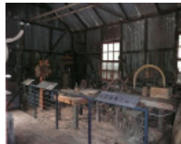
FORMER BLACKSMITH'S COTTAGE AND SHOP SOHE 2008