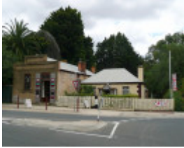
FORMER BLACKSMITH'S COTTAGE AND SHOP SOHE 2008