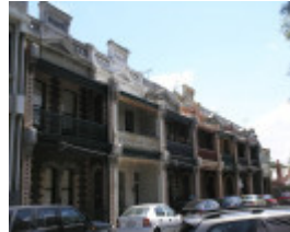
EMERALD HILL ESTATE SOHE 2008