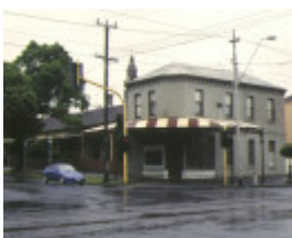
1 park street/emerald hill estate south melbourne 292 park street corner view nov1995