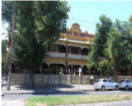
EMERALD HILL ESTATE SOHE 2008