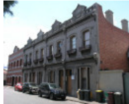
EMERALD HILL ESTATE SOHE 2008