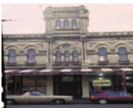
1 park street/emerald hill estate south melbourne 256- 264 park street facade detail oct1995