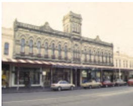
1 park street/1 emerald hill estate south melbourne 256- 264 park street front facade oct1995