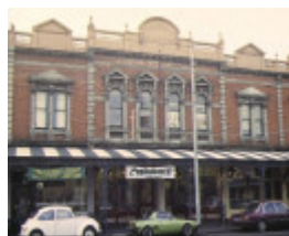
1 park street/emerald hill estate south melbourne 270- 286 park street facade detail oct1995