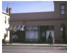
1 park street/emerald hill estate south melbourne 242- 244 park street front view oct1995