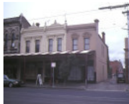
1 park street/emerald hill estate south melbourne 248- 256 park street front view dec1984