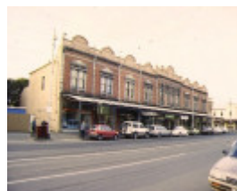
1 park street/emerald hill estate south melbourne 268- 286 park street front view oct1995