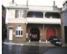
1 hawthorn fire station front view