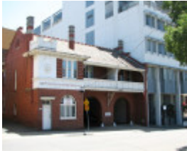
FORMER HAWTHORN FIRE STATION SOHE 2008