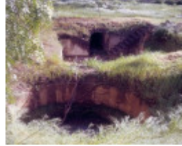
h01330 former thoona dairy and butter factory sargeant street thoona over butter factory remains she project 2004