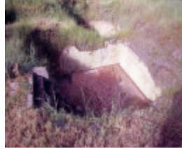
h01330 former thoona dairy and butter factory sargeant street thoona over exit tunnel she project 2004