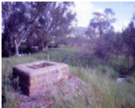
h01330 former thoona dairy and butter factory sargeant street thoona over underground water tank she project 2004