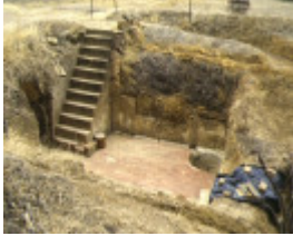
1 former thoona dairy & butter factory foundations