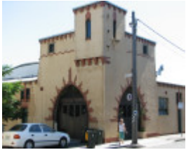
FORMER BRUNSWICK MARKET SOHE 2008