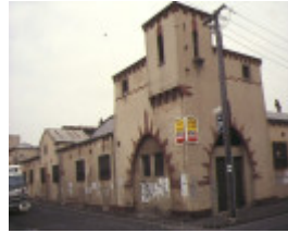
1 former brunswick market ballarat street brunswick front view apr1996