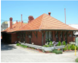
JENNERIAN BUILDING SOHE 2008