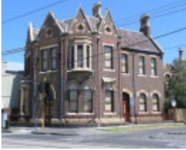
FORMER ES&A BANK SOHE 2008