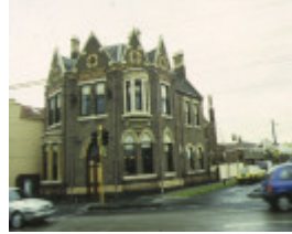
1 former es&a bank mount alexander road ascot vale front corner view aug1996