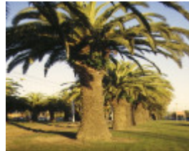
1 canary island date palm avenue mount alexander road essendon detail view