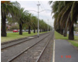
Canary Island Date Palm Avenue Mount Alexander Road Essendon June 2003