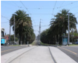
CANARY ISLAND DATE PALM AVENUE (PHOENIX CANARIENSIS) SOHE 2008