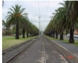
Canary Island Date Palm Avenue Mount Alexander Road Essendon June 2003