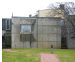
H2192 Fmr Clyde Cameron College Wodonga Aug 08 37