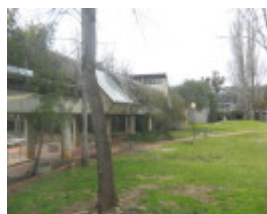
4938 Fmr Clyde Cameron College Wodonga Aug 08