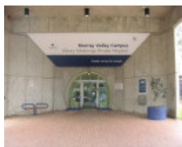
H2192 Fmr Clyde Cameron College Wodonga Aug 08