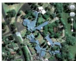
Clyde Cameron College.jpg