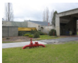
H2192 fmr Clyde Cameron College Wodonga Aug 08 36