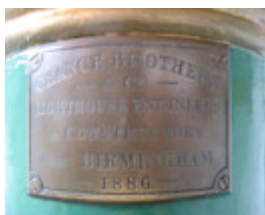
Chance Bros plaque