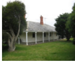
Split Point Lightstation assistants quarters