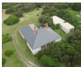
Head keeper's quarters from tower