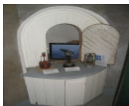
Opening to signal station