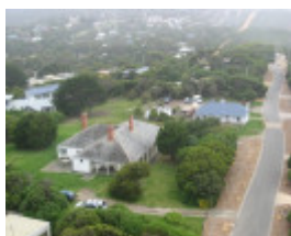
Split Point Lightstation assistant keepers' quarters & stable from tower