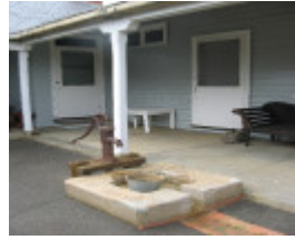
Split Point Lightstation water pump at keeper's house