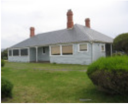
Split Point Lightstation head keeper's quarters