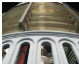
Split Point Lightstation lens array from below