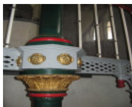
Staircase and column capital