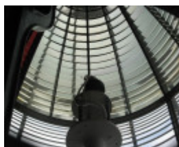
Split Point Lightstation interior of lens array and lamp