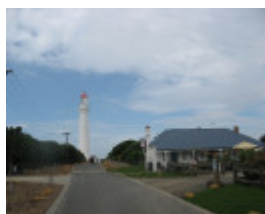
Lighthouse and stable