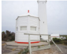
CAPE NELSON LIGHTSTATION SOHE 2008