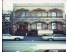
1 terrace 203 victoria parade fitzroy front view jul1984