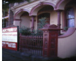
terrace 203 victoria parade fitzroy entrance gate jul1984