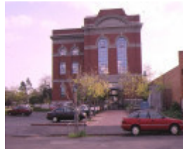
former north fitzroy electric railway substation brunswick street north fitzroy front view jun1995