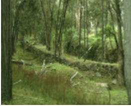
1 magpie creek gold mining diversion sluice magpie historic reserve beechworth slhy