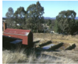
h01264 maldon state battery adair street maldon pits jul1994