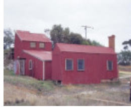
h01264 maldon state battery adair street maldon assay room battery she project 2003