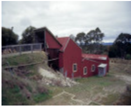
h01264 maldon state battery adair street maldon battery building she project 2003