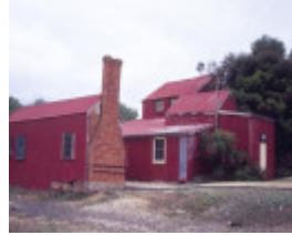
h01264 1 maldon state battery adair street maldon chimney assay room she project 2003