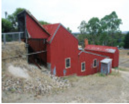
MALDON STATE BATTERY SOHE 2008