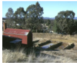
h01264 maldon state battery adair street maldon pits jul1994