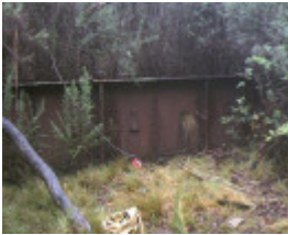
1 la mascotte treatment works side view