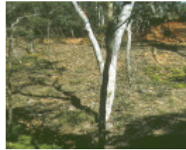
1 yackandandah creek hydraulic gold sluicing pit near beechworth cement workings