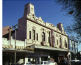
1 former barkley theatre barkly street footscray front view