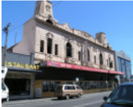
FORMER BARKLY THEATRE SOHE 2008