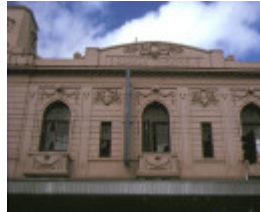
former barkley theatre barkly street footscray front windows aug1990