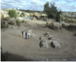
1 catherine reef united company gold mine eaglehawk aerial view may1993