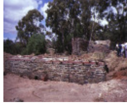
1 north british gold mine parkins reef road maldon side view dec1984