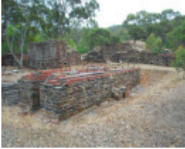
NORTH BRITISH GOLD MINE SOHE 2008