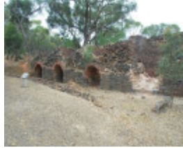
NORTH BRITISH GOLD MINE SOHE 2008