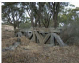
NINE MILE COMPANY GOLD MINE SOHE 2008