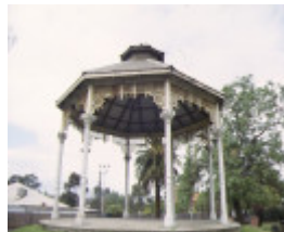
Footscray Railway Station Complex Irving Street Footscray Reserve Bandstand October 1998