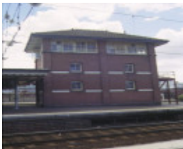
footscray railway station complex irving street footscray signal box sep1998