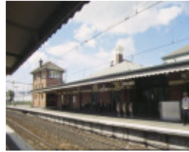
footscray railway station complex irving street footscray centre platform view sep1998