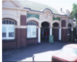
footscray railway station complex irving street footscray front view dec1985