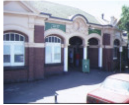
footscray railway station complex irving street footscray front view dec1985