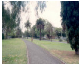
Footscray Railway Station Complex Reserve