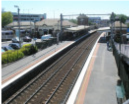
FOOTSCRAY RAILWAY STATION COMPLEX SOHE 2008