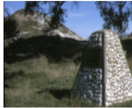
1 new australasian no 2 deep lead gold mine moores road creswick memorial