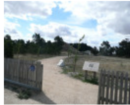
NEW AUSTRALASIAN NO. 2 DEEP LEAD GOLD MINING MEMORIAL AND SITE SOHE 2008