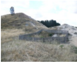
NEW AUSTRALASIAN NO. 2 DEEP LEAD GOLD MINING MEMORIAL AND SITE SOHE 2008