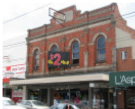
FORMER BATES BUILDING SOHE 2008