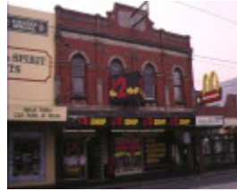
1 former bates building sydney road coburg front- view apr1996