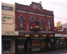
1 former bates building sydney road coburg front- view apr1996