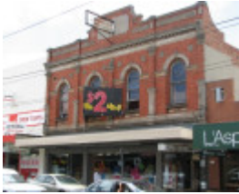
FORMER BATES BUILDING SOHE 2008