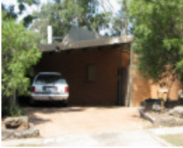
SOLAR HOUSE SOHE 2008