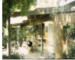
1 solar house rosco drive templestowe side view dec1996