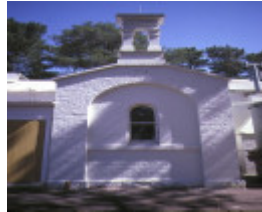
former franklindford common school entrance jan1985