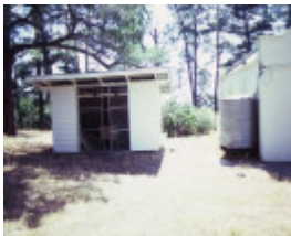
former franklindford common school rear view jan1985