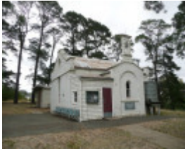
FORMER FRANKLINFORD COMMON SCHOOL SOHE 2008