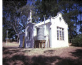
1 former franklindford common school front view jun1985