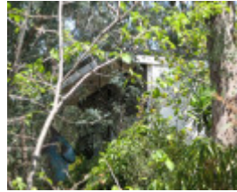
INGE AND GRAHAME KING HOUSE SOHE 2008