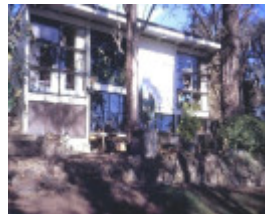
h01313 inge and grahame king house drysdale road warrandyte studios facing north she project 2003