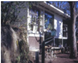
h01313 inge and grahame king house drysdale road warrandyte side view she project 2003