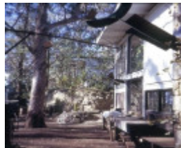
h01313 inge and grahame king house drysdale road warrandyte studios side north she project 2003