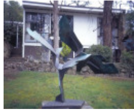
h01313 1 inge and grahame king house drysdale road warrandyte sculpture in garden she project 2003