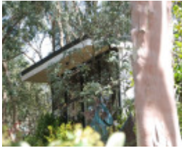
INGE AND GRAHAME KING HOUSE SOHE 2008