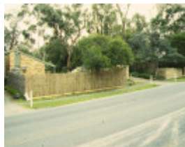
1 winter park cluster housing high street doncaster street view nov1996