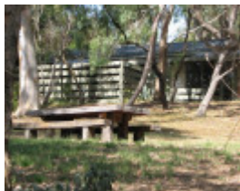
WINTER PARK CLUSTER HOUSING SOHE 2008