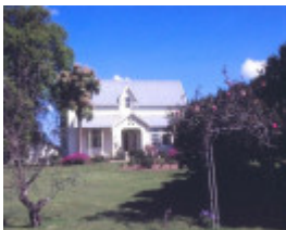
ballam park cranbourne road frankston front she project 2003