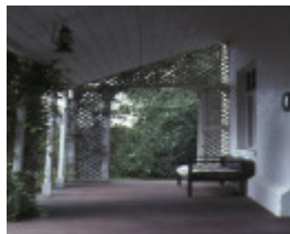
ballam park frankston front porch mar1984