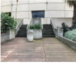
2017 stairs from Arts Centre Lawn to Hamer Hall.jpg