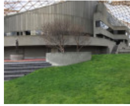
2017 in front of the Arts Centre.jpg