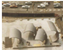
1981 During installation.gif