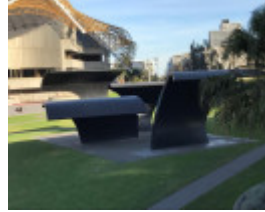
2017 Forward Surge .jpg