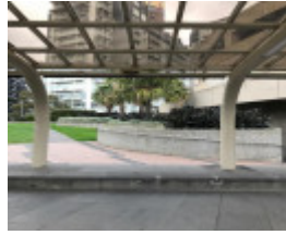
2017 garden beds next to Hamer Hall.jpg