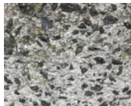
2017 mortar used for landscape elements (detail).jpg