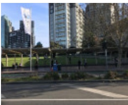
2017 from St Kilda Road.jpg