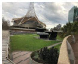
2017 view towards to Arts Centre.jpg