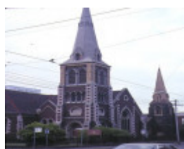
1 former presbyterian church buildings sydney road brunswick front view