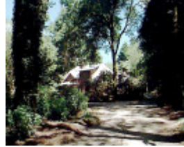
1 streeton residence olinda dec1999 dw