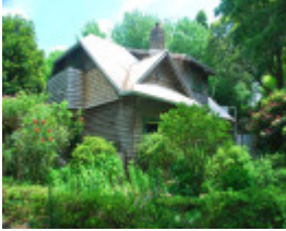
LONGACRES SOHE 2008