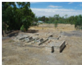
COSTERFIELD GOLD AND ANTIMONY MINING PRECINCT SOHE 2008