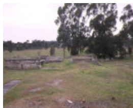
1 costerfield gold & antimony mining precinct costerfield side view