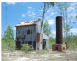
COSTERFIELD GOLD AND ANTIMONY MINING PRECINCT SOHE 2008