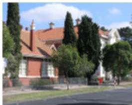
FORMER ESSENDON HIGH SCHOOL SOHE 2008