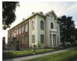
1 former essendon high school buckley street essendon front entrance oct1996