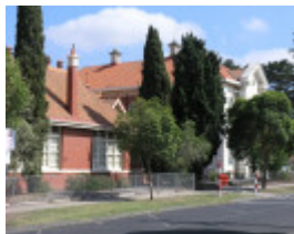
FORMER ESSENDON HIGH SCHOOL SOHE 2008