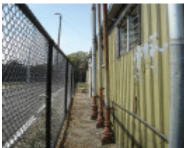
H1343 Exterior - West facade, with raised ground level. Dec. 2006.