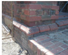
H1343 Existing condition - Exterior, south-east corner, dislodged brickwork and missing mortar. Dec 2006.