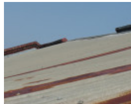
H1343 Existing condition - Roof, looking east, note sagging ridge. Dec 2006.