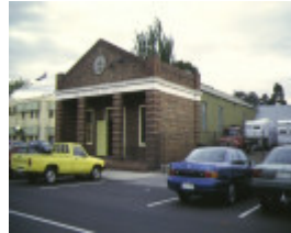
1 first footscray scout hall hyde street footscray front view apr1997