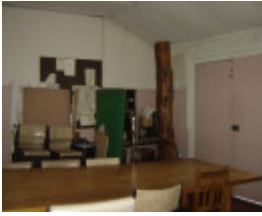
H1343 Interior of kitchen extension. Dec 2006.