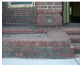
H1343 Exterior - East (front) facade, dislodged brickwork and missing mortar. Dec 2006.