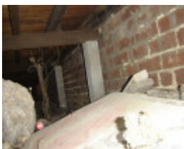
H1343 Subfloor, at shed hall to brick front junction. Dec 2006.