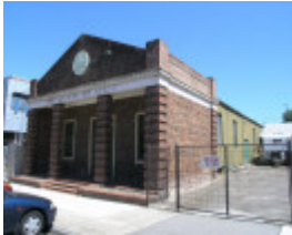
KARIWARA DISTRICT SCOUT HEADQUARTERS SOHE 2008