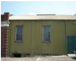
H1343 Exterior - North facade, note sagging roof sheeting. Dec 2006.