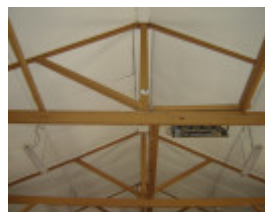
H1343 Interior - roof truss at east end of hall with missing strut. Dec 2006.