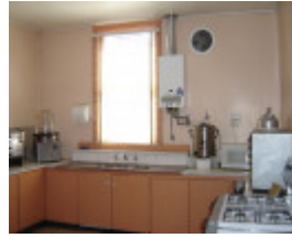
H1343 Interior of kitchen extension - general view. Dec 2006.