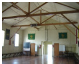
H1343 Interior - general view looking east. Dec 2006.