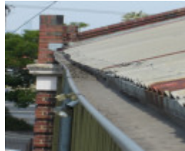
H1343 Existing condition - Eaves gutter north side. Dec 2006.