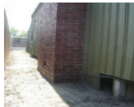
H1343 Exterior - South facade, with raised ground level. Dec 2006.