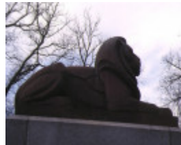
south african soldiers memorial albert street south melbourne lion (prior to the removal of the memorial)