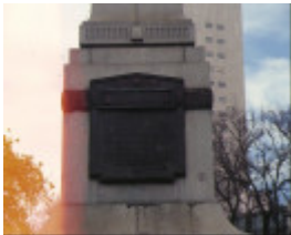
south african soldiers memorial albert street south melbourne inscription & base (prior to the removal of the memorial)