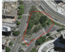
Existing aerial view as of May 2023 (the image shows Albert Reserve in the course of alteration. The amended extent is outlined in red).