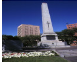
1 south african soldiers memorial albert street south melbourne front view (prior to the removal of the memorial)