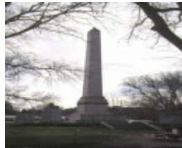
south african soldiers memorial albert street south melbourne rear view (prior to the removal of the memorial)