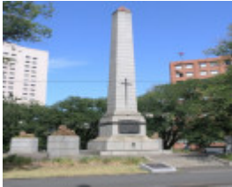
SOUTH AFRICAN SOLDIERS MEMORIAL SOHE 2008