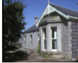
frogmore homestead hamilton highway fyansford bay window