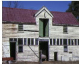
1 frogmore hamilton highway fyansford stables front view