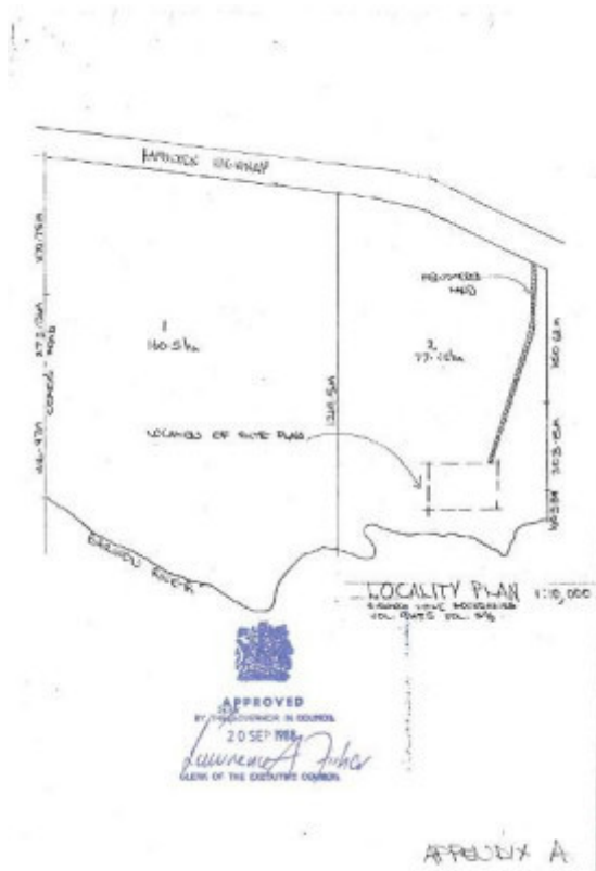
frogmore appendix a.JPG