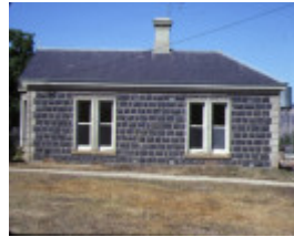
frogmore homestead hamilton highway fyansford side view