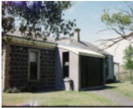
frogmore homestead hamilton highway fyansford rear elevation oct1994