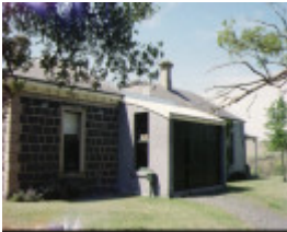
frogmore homestead hamilton highway fyansford rear elevation oct1994