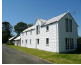
FROGMORE SOHE 2008