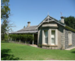
FROGMORE SOHE 2008